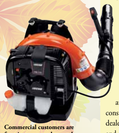
favoring more and more the tube throttle over the hip-located throttle.

The blower product category is seeing strong sales in the spring, but the big numbers typically come in the fall with the debris cleanup.