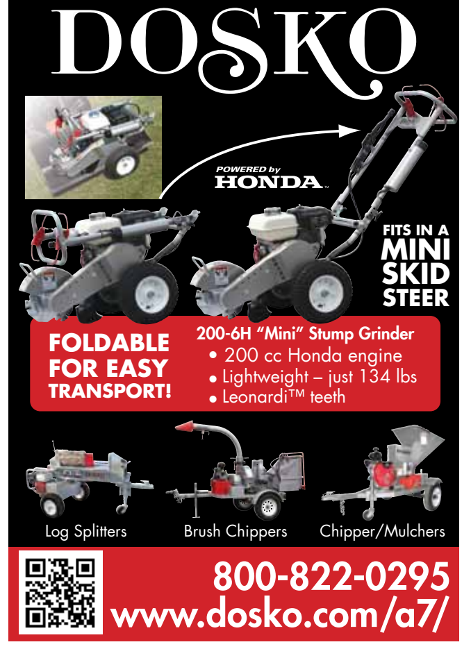
> Visit greenindustrypros.com/yg/einquiry and enter 29