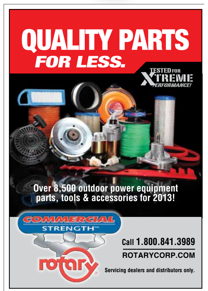
> To inquire, visit greenindustrypros.com/10155905

Supplied by Charter Software, provider of the ASPEN Windowsbased business management solution that helps dealers manage customer relations in the ways listed above. For more information, visit greenindustrypros.com/10708600.