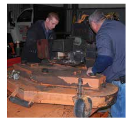
Employees have been included in the process improvent exercises and helped to greatly increase shop efficiency.

"Look around at your competitors to see how they operate," says Hampton. "Open your eyes and ears and learn from everybody everywhere. Without change, you are going to end up right where you are now. Change is cheap. Not changing will cost you more in the long run." (