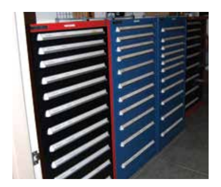
Parts are stored in a Vidmar cabinet system and are each tracked on the computer. More cabinets will be added after the dealership expansion is completed.

When doing the time and motion studies, they also include staff in the process. Their participation is not